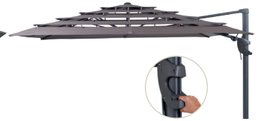
Monaco Open Air Square free hanging