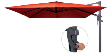
Monaco Flex III free hanging