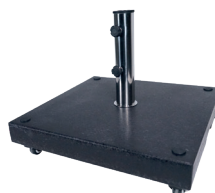
Parasol base 60 kg with swivel wheels VOE9P033