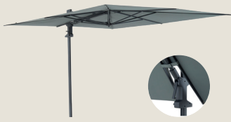
Saint Tropez free hanging