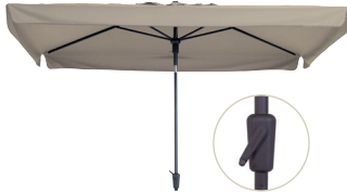
Delos Luxe standing