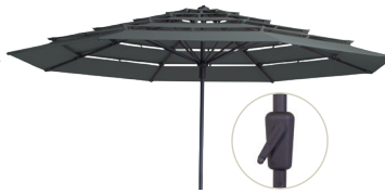
Syros Open Air Round standing