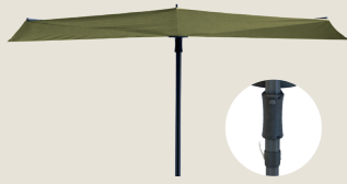
Sun Wave balcony