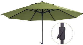
Timor Luxe Round standing