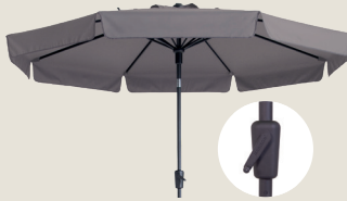
Flores Luxe standing