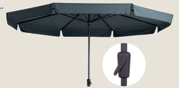
Syros Luxe Round standing