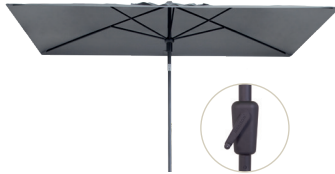
Mikros Luxe standing