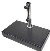
Parasol base 30 kg VOE8P033