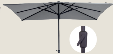
Syros Luxe Square standing