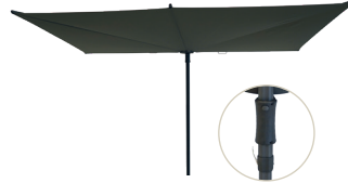
Sun Square balcony