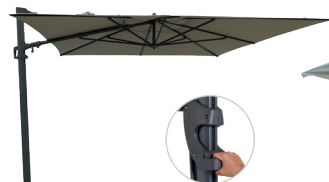
Malta free hanging