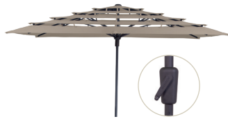
Syros Open Air Square standing