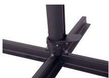
Cross base VOE7P033