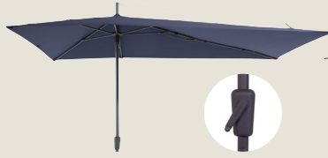
Asymmetric Sideaway standing