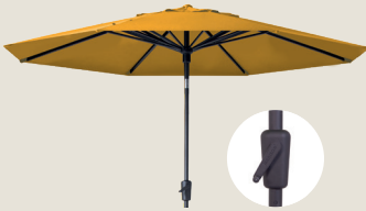
Paros luxe II standing