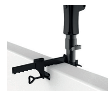
Balcony clip Sunwave VOE5P033